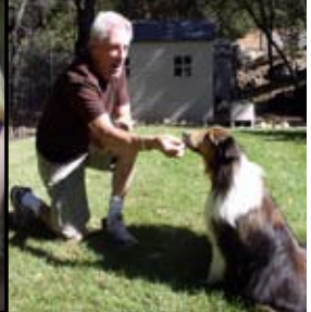
Hanley's Adoption Day October 2014